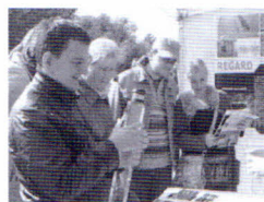
Fig.5.Visitors at Open Day

Atomki and Wigner RCP organizes Open Days, the last ones were devoted to particle physics. Wigner RCP's last one coincided with CERN's Open Day and this year it will be devoted to CERN's 60 th anniversary.