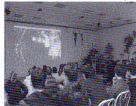
Fig. 3. Secondary school pupils in a CERN Virtual Visit

In these visits, developed on the request of Hungarian physics teachers, the schools' workstations have a 3-way audio-visual connection to the control room of an experiment and to a mobile unit. First the convenor in the control room introduces the experiment, then the mobile unit shows various places of the experiment, some of which are even off-limits for visitors. These visits make it possible to visit experimental areas at CERN for whole classes in their class room, without having to travel to