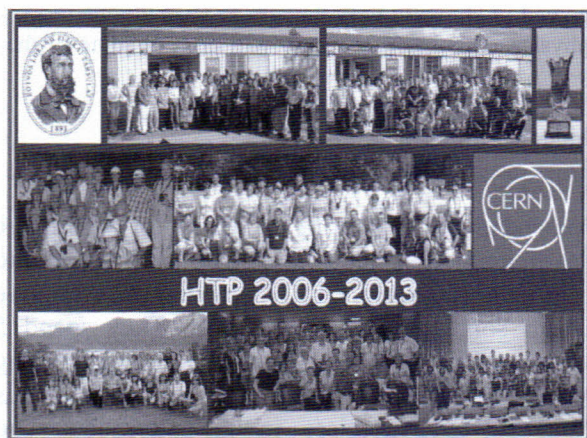
Fig. 1. Participants of the Hungarian Teachers' Program

We organize a follow-up meeting at the end of the year, where the participants report on the results of the teachers' experiments and we analyse the evaluation sheets of the individual lectures, visits and teachers' experiments made at CERN and during the travel. That post-meeting is attended by all the teachers and most of the lecturers, by the representatives of CERN and of the sponsors, the Director General of Wigner RCP, the Secretary of the Hungarian CERN Committee and the Chairperson and Secretary General of the Hungarian Physical Society. This programme is quite popular and heavily oversubscribed, and the involved teachers organize student visits to CERN regularly.